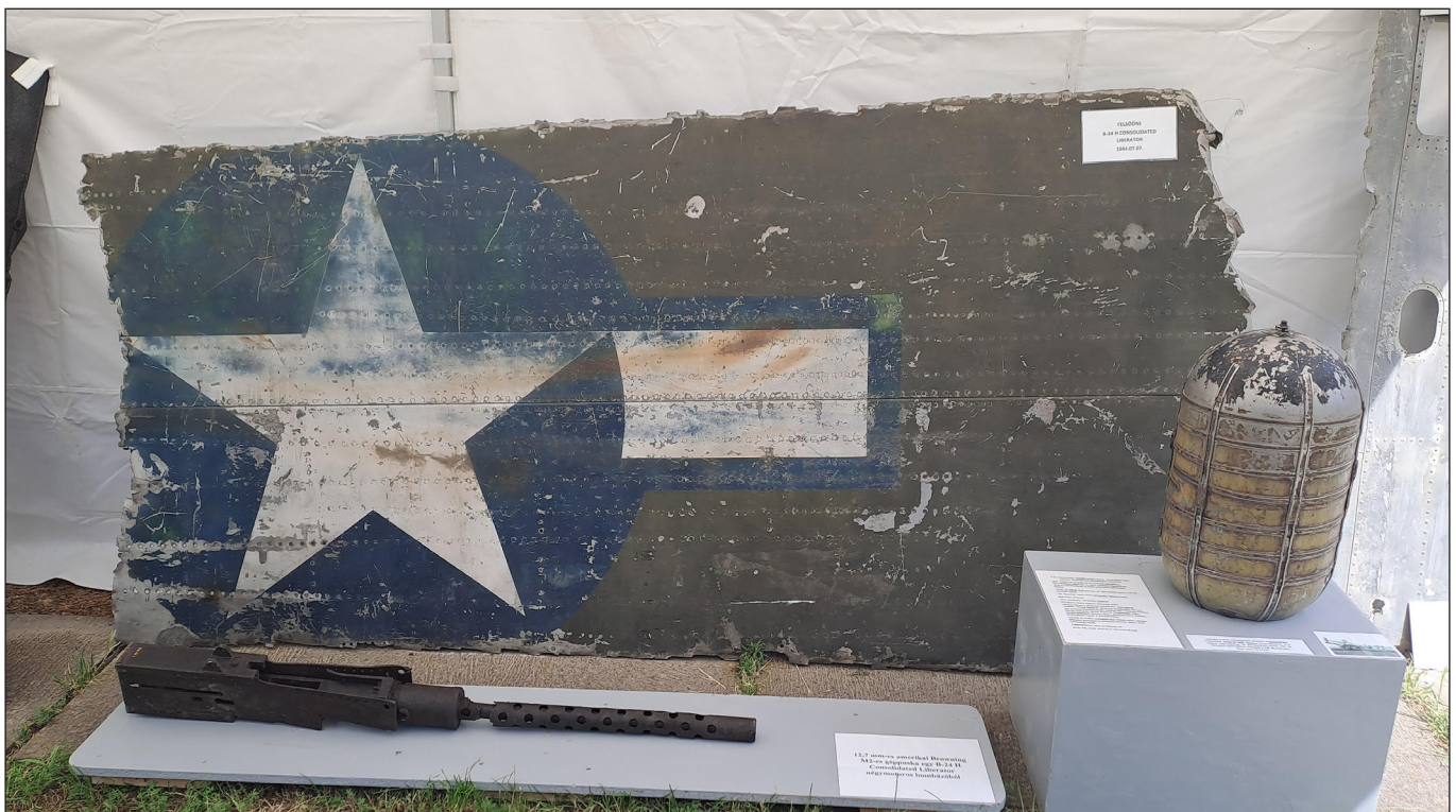
Fig. 2. Wreckage of an American B-24 LIBERATOR aircraft (Felsőörs–1944). Collection of Csaba D. Veress, Laczkó Dezső Museum (7th Defense Day of Veszprém, 2025)