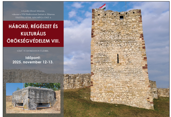
Fig. 1. Invitation to the 2025 conference