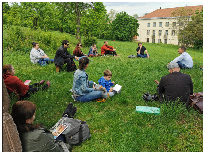
Fig. 2. Departmental meeting on the side of the Calvary Hill of Miskolc, 2020

We slowly returned to the museum in early summer. Entering the hallway, I was struck by the “old scent” from the building's warehouses, which