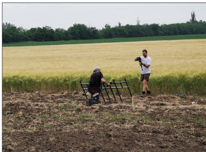
Fig. 4. Filming of our own documentary for Archaeology Day 2020

I missed dearly. We shared the quarantine experiences continuously interrupting each other. Soon, within the scope of Archaeology Day, we welcomed guests again, albeit in small numbers, to our “Régész Terasz” [Archaeologist Terrace] programme (Fig. 3), where we presented our homemade documentary in a screening discussion-like manner (Fig. 4). In this, we presented the diversity of archaeological tasks through the performed work in the area of the gravel mine in Nyékládháza, and how we get from contracting, through site survey to the period of observations and excavations. It was a good feeling to see interested faces again and discuss the arising issues. By this time, the system of field work had already developed. Then the restric-