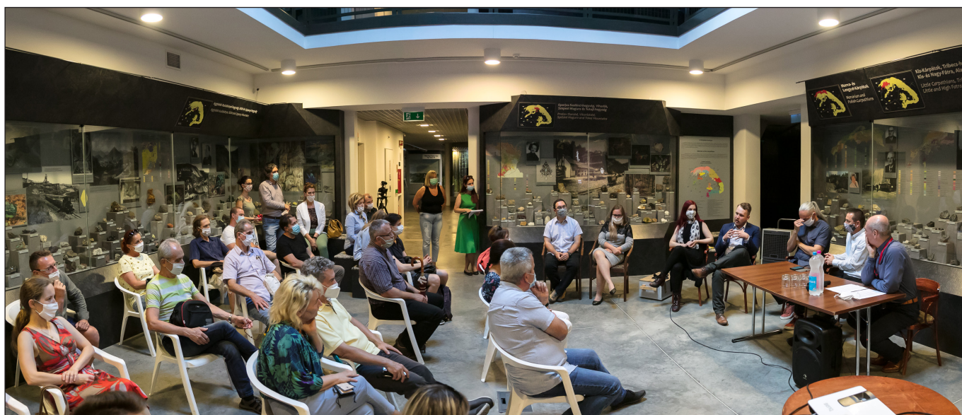
Fig. 3. I. Open-air Archaeological Gathering at Miskolc, Archaeology Day 2020