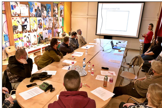
Fig. 5. Programme of the 1st Open School of Community Archaeology

We have been through a period with many cancellations. In 2021, we had to postpone the 10th Jubilee Northeast Hungarian Regional Archaeology Conference, which we definitely did not want to organize without the opportunity for face-to-face meetings. This year, however, we will make up for it! We cancelled the usual team-building, year-end events, when we could have broken out of the busy everyday life to celebrate our results together. Although, we also have successes behind us. The Community Archaeological Education Programme - albeit with only two occasions - continued in 2021 , and we have already held the first day of education in 2022 , with really positive feelings (Fig. 5). On the occasion of Archaeology Day, we took an excursion