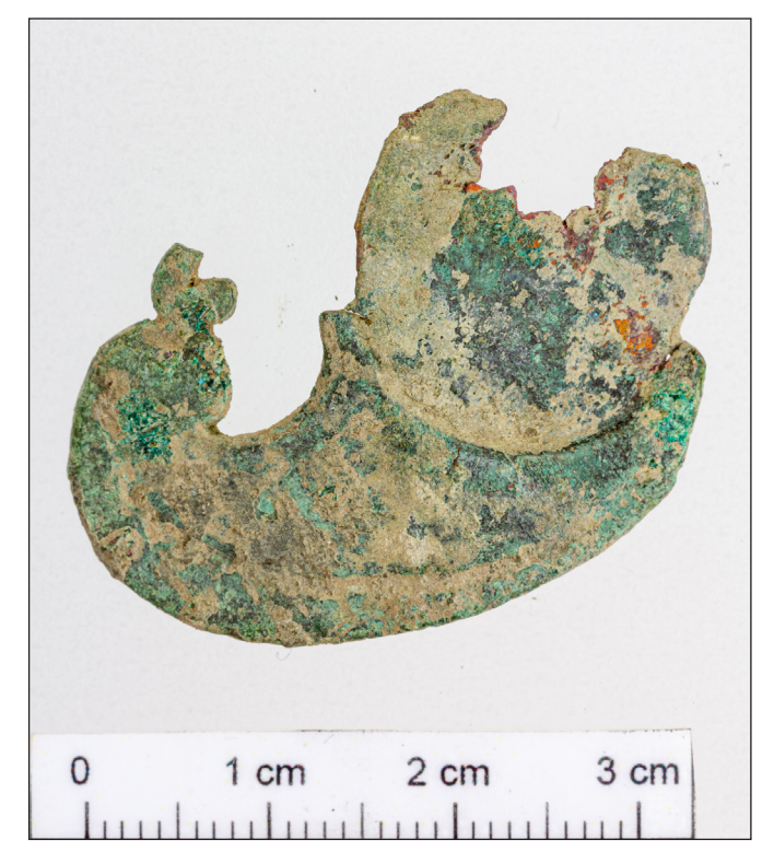
Fig. 5. Blank that was improperly cut and remained attached to the sheet used for the raw material from Kisdorog (before cleaning)