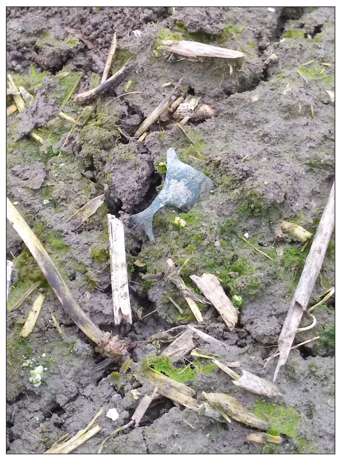
Fig. 4. Clipping from the field walk and surface recovery at Tolna