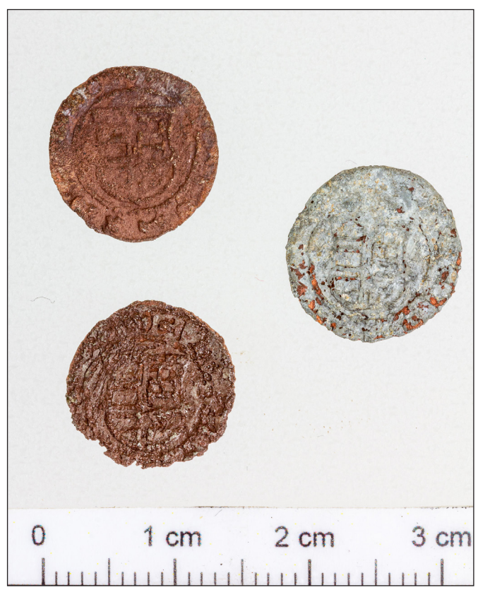
Fig. 8. Fake dinars from the beginning of the 17th century from Gyulaj (restored condition)

shop-complex in Gyulaj-Szakály). It should not be ignored that a significant portion of the inhabitants in Tolna County were from the Balkan – primarily Southern Slavic – minority, the so-called "rác" (Serbian) people. In the decades after the Long Turkish War (1591–1606), they often did not take up residence in the destroyed medieval Hungarian villages, but created new, independent settlements next to them. Here it is not possible to elaborate the increasing archaeological traces and evidence of this, but the suspicion is strong that this population can be linked to certain evidence of counterfeiting identified at Ottoman Period settlements without medieval roots, just as the press mould mentioned in connection with the Zomba workshop indicates.