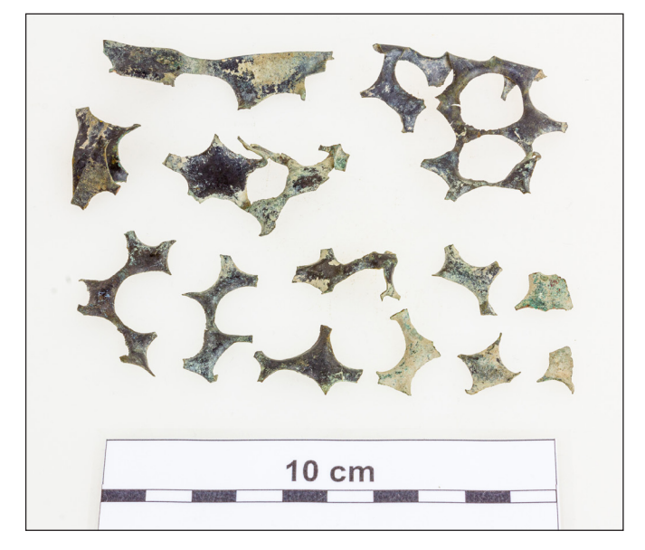
Fig. 2. Clippings of various shapes from Tolna (before cleaning)