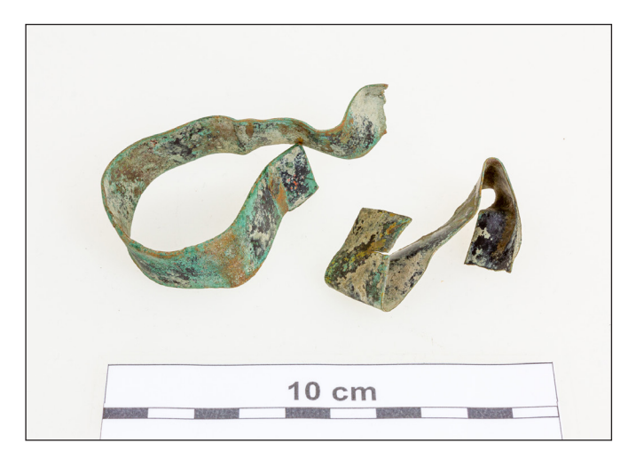
Fig. 3. Copper bands for making blanks from Tolna (before cleaning)