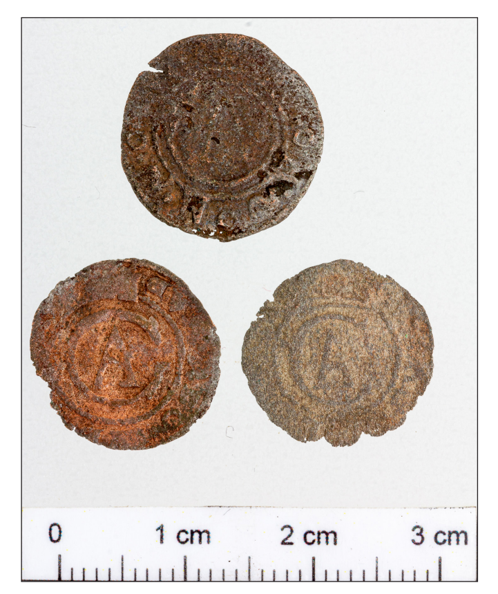
Fig. 7. Counterfeit coins with the name of the Swedish King Gustavus Adolphus II (1611–1632) from Kisdorog (before cleaning)