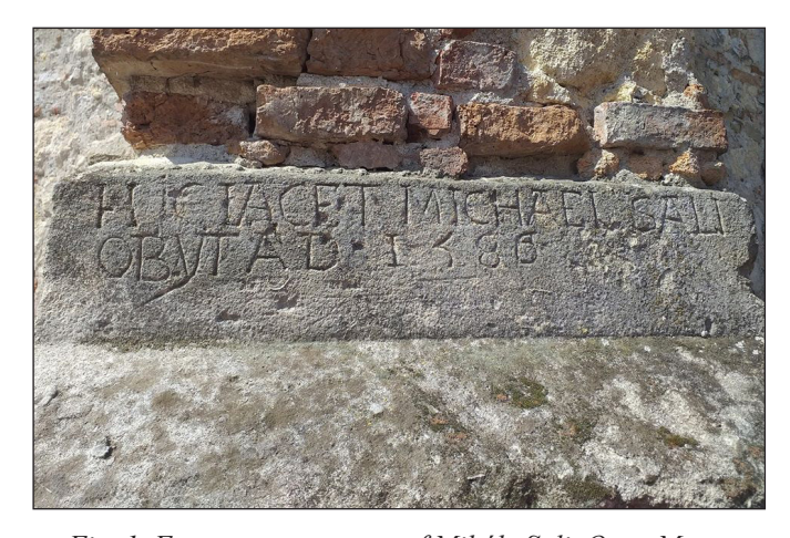
Fig. 1. Funerary monument of Mihály Sali, Ocna Mureş

A photograph of an inscription on a stone, taken in Ocna Mureş, Transylvania (present-day Romania), was posted in April 2020 in the Facebook group called Monument Forum (in Hungarian, M"ueml'ekek F'oruma). The photo generated a large interest among the members of the forum (Fig.~I). The ashlar served as a coping stone on one of the external buttresses supporting the wall of the choir. The building is a ruin today: it has lost its roof, and pens as well as other outbuildings belonging to the neighbouring houses were attached to the walls both inside and outside. The 70 \times 40 cm large surface of the stone presented in the photo had been carved flat and it displays the following inscription in Latin: HIC IACET MICHAEL SALI | OBYT A(NNO) D(OMINI) 1586 – "Here lies Michael Sali, he died in the year of the Lord 1586."