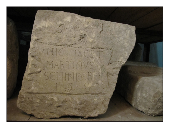
Fig. 5. Funerary monument of Martinus Schinder. Cluj, National History Museum of Transylvania. Inscription: HIC IACET | MARTINVS SCHINDER | 1583 ("Here lies Martinus Schinder 1583")

( Figs 4, 5, 6 ). Another stone was transferred to the Central (Házsongárd) Cemetery and built into the facade of the crypt established for members of the Bethlen of Iktár family ( Fig. 7 ). Five ashlars turned into funerary monuments are still in their original place, built in the city wall ( Figs 8 and 9 ). The stones were shaped either by creating a flat, deeper surface for the inscription or by carving back the surface around the inscription plaque. In the latter cases, two schematic "handles" were added to the flat surface in the form of a tabula ansata ( Figs 4, 5, and 7 ). The inscriptions were written with Renaissance capital letters, but the epigraphic quality varies depending on the skills of the stone cutter.