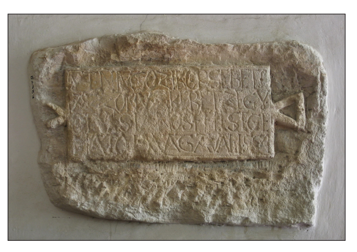
Fig. 4. Funerary monument of Erzsébet, wife of János Keretszegi Eötves, and their five family members. Cluj, National History Museum of Transylvania. Inscription: YT NIVGOZIK EORSEBET | AZZONY KERETZEGY | EOTVES IANOS FELESEGE | HATOd MAGAVAL 1554 ("Here lies Erzsébet, wife of János Keretszegi Eötves with five others 1554")

Nine such memorials are known to have survived in Cluj: three are now stored in the lapidary of the National History Museum of Transylvania, where they were taken after they were removed from those segments of the wall which had to be demolished