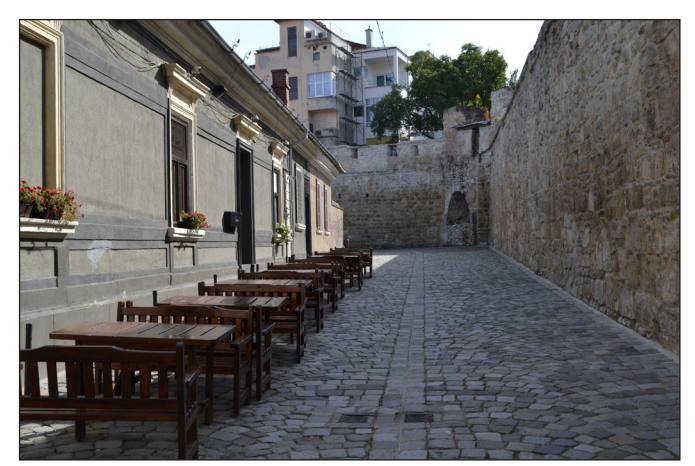
Fig. 3. The town wall of Cluj

Returning to Transylvania and to the 16th century, the highest number of such commemorative texts carved into the stones of an earlier built structure survived in Cluj. Here, however, it is not the walls of a church but those protecting the town that bear the inscriptions. The graves belonging to these funerary monuments were not established in a churchyard cemetery but in the first public cemetery of the town. The inscriptions were first collected by István Nagyajtai Kovács in the 1840s, encouraged by John Paget, an English physician and traveller (NAGYAJTAI KOVÁCS 1840; NAGYAJTAI KOVÁCS 1843). The plots stretching along the walls were sold out by the end of the 18th century, and, since the wall