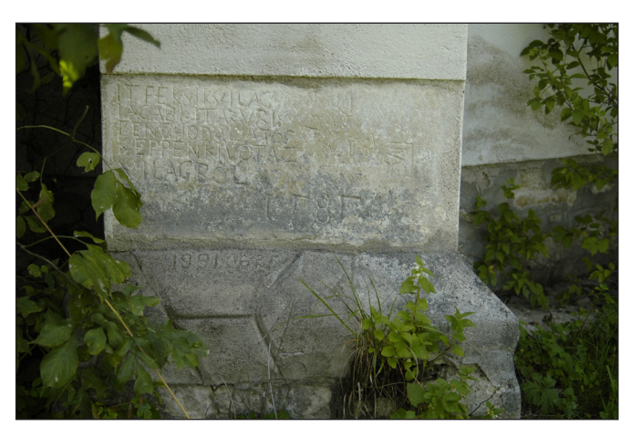
Fig. 2. Funerary monument of Jakab Szilágyi, Zimbor