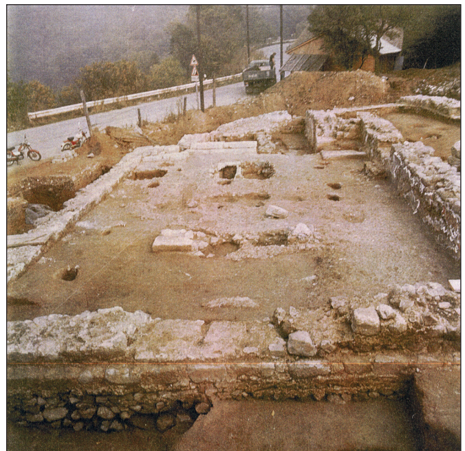
Figure 1: Excavation of the parish church in 1978 viewed from the western façade

The careful design of the edifice as well as its dimensions both suggest it being a significant ecclesiastic institute and so does the burial structure contemporaneous with the church located in front of the sanctuary. Two bye-altars were recorded on either side of