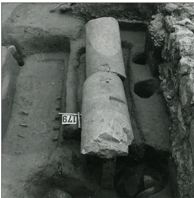
Figure 6: The two graves unearthed within the annex: the one with the Roman column as a tombstone on the right, the exhumed one on the left

The noble status of three adults (one female, two males) buried in the vicinity of the church is attested by three golden rings deposited in their graves. Dateable coins issued by Kings Salomon, Géza I and Ladislaus I of Hungary recovered from both burial groups suggest burials were contemporaneous and differed only by following either the more traditional custom of linear burials or the Christian rite of burying in close vicinity of the church. The latter may be sepultures of the lords of the county castle, including the count and his family.