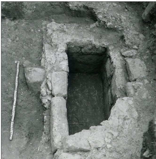
Figure 5: The grave structure discovered in front of the sanctuary

The noble status of three adults (one female, two males) buried in the vicinity of the church is attested by three golden rings deposited in their graves. Dateable coins issued by Kings Salomon, Géza I and Ladislaus I of Hungary recovered from both burial groups suggest burials were contemporaneous and differed only by following either the more traditional custom of linear burials or the Christian rite of burying in close vicinity of the church. The latter may be sepultures of the lords of the county castle, including the count and his family.