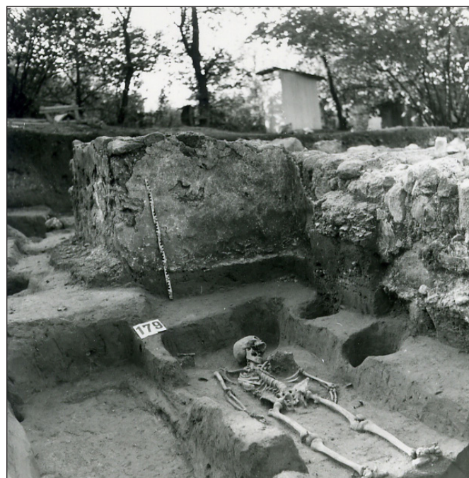
Figure 7: The same two graves as on Figure 6 in a later phase of excavation

Two grave groups of the most prominent members of the community were observed both in the linear cemetery and in the one on the western side of the second church. Rich grave goods attest high social status and wealth, including coins of Kings Salomon I, Géza I, Ladislaus I and Dux Géza of Hungary), circle hair clips, pearl necklaces, boar tusks, arrowheads in the linear cemetery and coins of King Ladislaus I of Hungary, golden and silver circle hair clips and rings and a Roman column fragment placed atop one of the graves as a tombstone.