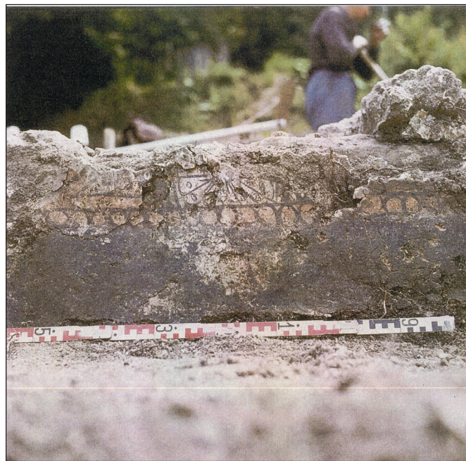
Figure 2: Mural section on the plinth of the southern wall of the sanctuary

The relation between construction layers and diverse building sections indicates that this second church was erected in two phases. First the main edifice of the church was finished, the gallery was placed subsequently in the western end before completing the construction. The staircase tower was erected next to the gallery later on. It is not possible to determine what changes this reconstruction engendered in the superstructure although it is certain that the annex, possibly an open vestibule joining the church from the south was erected at the time of the reconstruction. It is enclosed by 23 m long wall with two openings facing the hillside, joining the eastern corner of the sanctuary. The southern entrance of the church can only be accessed through this annex. Its forefront served as a meeting point and burial ground with the tombs of local nobility. Finds recovered from its vicinity attest that the annex was surrounded by a fence and a wattle and daub house was constructed nearby with a little farmyard which may have served as residence for the clergymen of the church. (Figure 3)