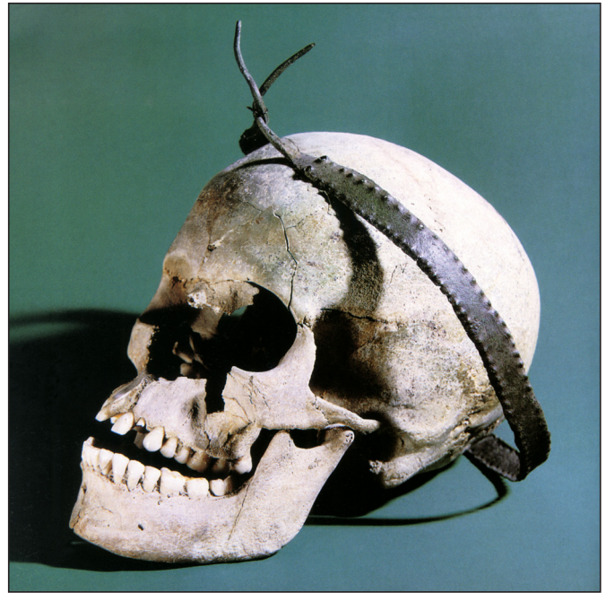
Fig. 3. The diadem of Vörs