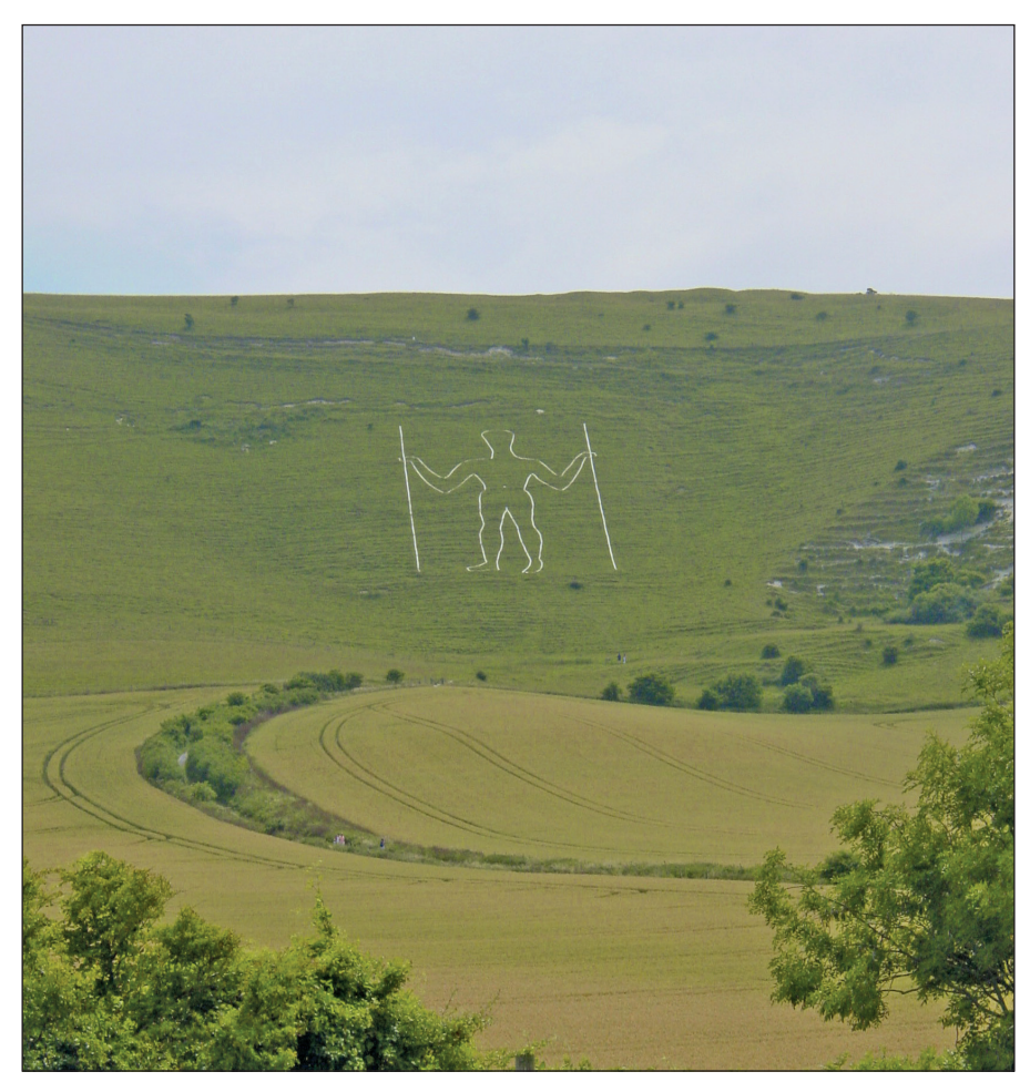
Fig 5: The Long Man of Wilmington

The last stop was a visit to the Long Man of Wilmington, a 72 m tall figure carved into the chalk hill. It was earlier believed to date from prehistory, but more recent studies have shown that it was probably made in the 16<sup>th</sup>–17<sup>th</sup> century. It was originally known as the Green Man. Its current white colour comes from the white-painted breeze blocks that were used to replace the earlier bricks in 1969.