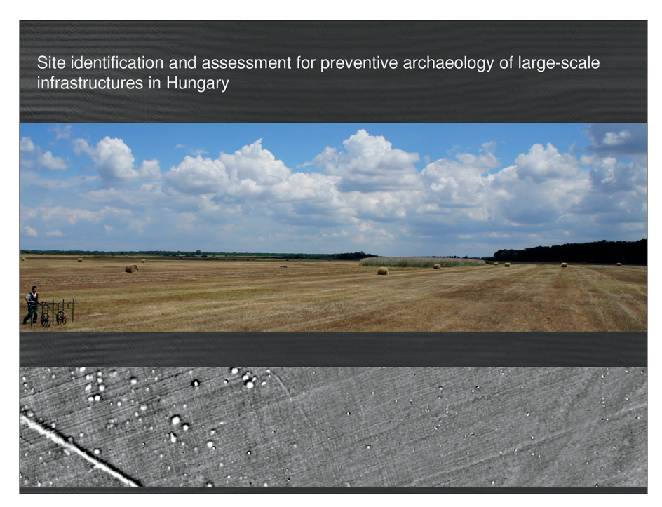
Fig 3: Part of Mate Stibrányi's presentation discussing preliminary archaeological documentation

European University in Budapest and the university's recently launched course on heritage protection and management.