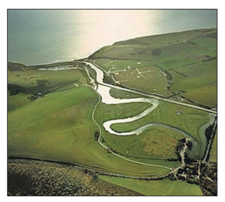
Fig 4: Meanders of Cuckmere River

As part of The Cuckmere Estuary Pathfinder Programme, community members were informed about various options and were shown modelled outcomes. Following a series of discussions and consultations, the local communities voted for the preservation of the historic landscape and against the re-admission of saltwater in the local referendum.