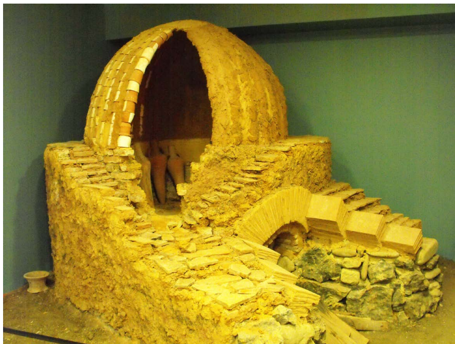
Figure 3: Reconstruction of an amphora kiln in the Sinop Archaeological Museum

workshops were uncovered at Zeytinlik 6 and Demirciköy, 7 a Late Antique burial chamber was investigated at Sinop–Gelincik, 8 and town houses with Late Antique mosaic floors were brought to light at Sinop–Meydankapı mahallesi. 9 The church of a rural settlement was also excavated at Çiftlik. 10 A research team led by Gülgün Köroğlu is currently investigating the Late Roman bath complex of Balatlar. 11 Two American research projects have contributed greatly to a better knowledge of the area’s history: four Late Antique merchant ships were discovered during deepwater sonar surveys, part of the “Black Sea Trade Project” directed by Robert Ballard, 12 while the participants of the “Sinop Regional Archaeological Project” (SRAP) led by Owen P. Doonan have conducted landscape archaeological research and field surveys on the Sinop Peninsula. 13