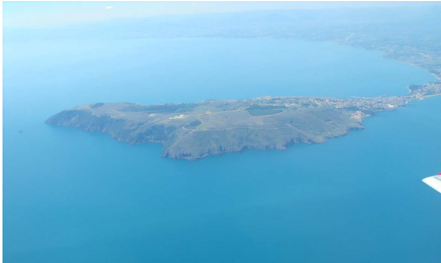
Figure 6: Aerial view of Sinope

for transporting Chian wine, which is thus also an indirect indication of the consumption of wine. 21 Interestingly enough, amphoras of this type have not been found in the eastern Pontic during the Late Antique period (5 th –7 th centuries), suggesting that this region was principally engaged in trade with Sinope and not with the Mediterranean or the Aegean.