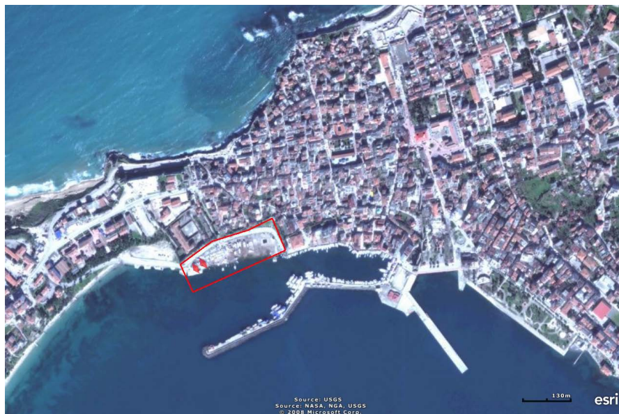
Figure 2: The ancient and medieval harbour of Sinope (marked with red)

these areas. 2 This research has a relevance for the archaeology of the Carpathian Basin too, because the archaeological record suggests that one of the major trade routes between Byzantium and the peoples of the Eastern European steppe probably led across the sea.