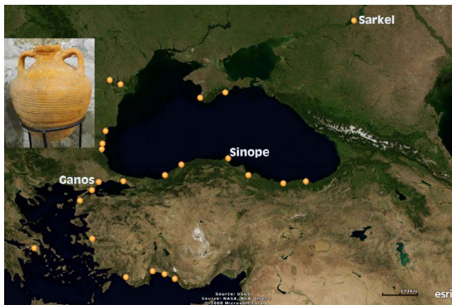
Figure 4: Distribution of Günsenin's Type 1 amphora