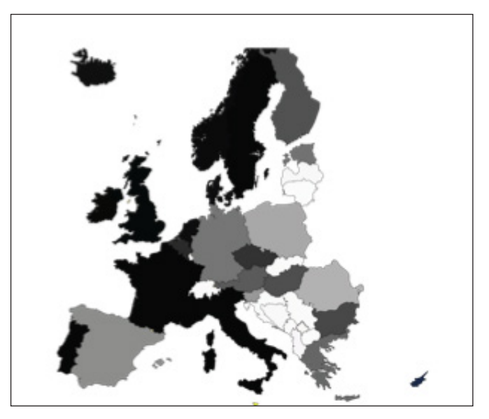
Fig. 2. Coverage of the ARIADNEPlus portal

searchable, findable, accessible, interoperable, and reusable, played a major part. Based on these criteria and the Linked Open Data principle, which makes interoperability accessible, we have sought to standardise and improve data integration through data analysis tools, GIS, and 3D visualisation. In addition, we wanted to create a stable research network through conferences, workshops, and training sessions. The outbreak of the Covid epidemic has had some impact on these efforts, with most workshops and conferences between 2019 and 2021 having been held in the online space, but there has been an ongoing collaboration between partner institutions. As a result, thanks to development and data sharing, more than 3 million records - each comprising several texts and images – are available through the ARIADNE portal today.