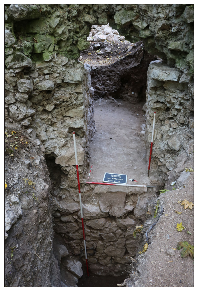
Fig. 4. Szádvár – Lower Castle, view from the pedestrian gate, 2018

The question arises, what makes this initiative successful and sustainable. First of all, Szádvár was a fortunate choice – the ambiance of the place definitely played a part, i.e. the fact that it is a huge and significant castle, and an almost unknown site, hiding in the woods of the national park, in a wonderful environment, distant from everything. Leaving behind the busy towns, with all their amenities, is itself attractive from the point of view of our modern lifestyles. On another note, there is no doubt that the initiators and the first volunteers were coming from those circles, which cultivate a genuine interest in castles, ruins and objects of cultural heritage. It is important, however,