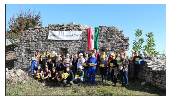
Fig. 10. Recurrent visitors of the Castle Saving Week: students of the Hild József High School

covering the neighbourhood, just as well as by learning about the medieval history of the castle. It is also an important detail of cooperation in connection to social media, that we pay attention to publish only photos and videos about the work, which do not violate professional interests in general, i.e. the publication rights of the archaeologist, or of the developer.