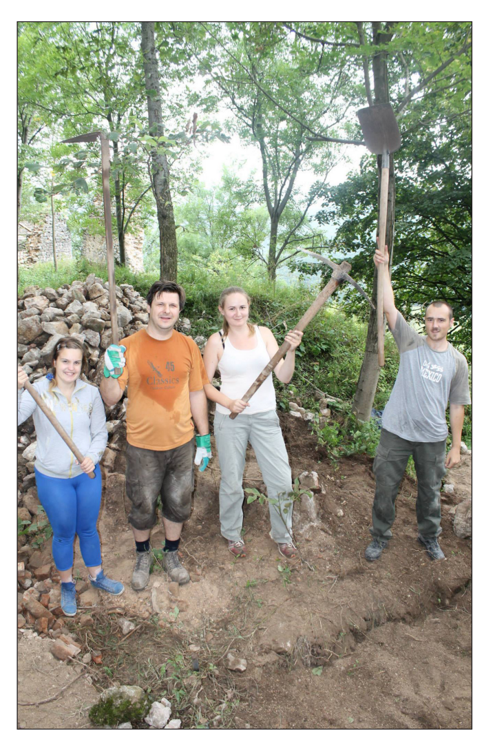
Fig. 8. Volunteers on the Castle Saving Week