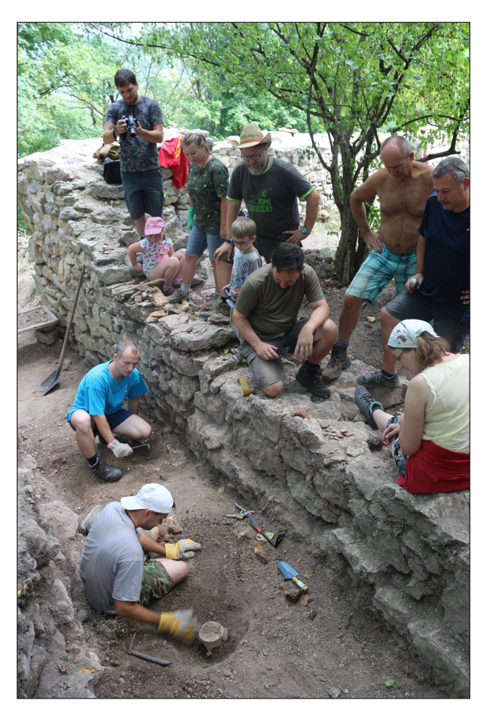
Fig. 6. Volunteers on the Castle Saving Week