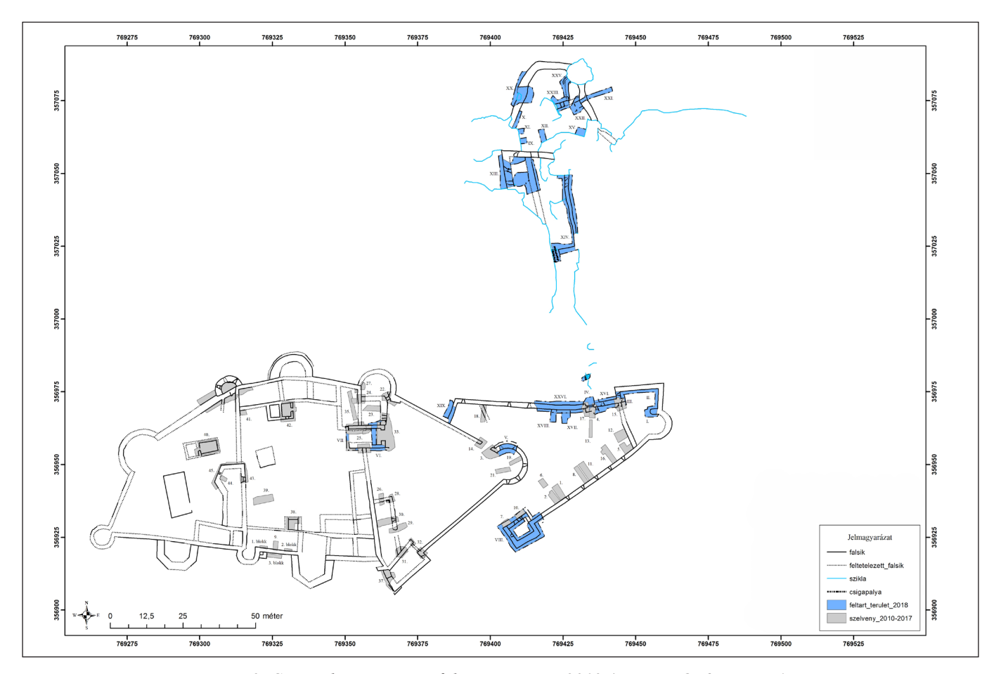
Fig. 2. Comprehensive map of the excavation, 2019 (Herman Ottó Museum)