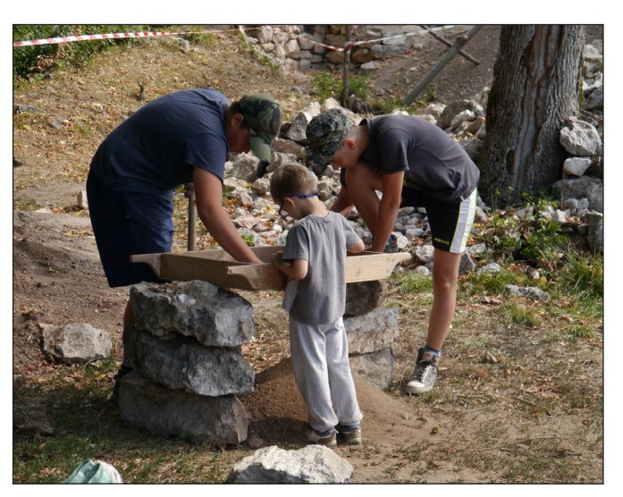
Fig. 9. Volunteers on the Castle Saving Week