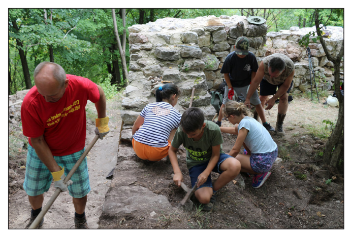
Fig. 7. Volunteers on the Castle Saving Week

unteer as an "archaeologist?" Beyond the sheer act of discovery, truffle finding, or the idea of "everyone is an archaeologist at heart", the most important motivation for volunteers must be the instinct of doing something good by contributing to the preservation of our common cultural heritage ( Figs 6–7). This clearly amplifies and satisfies also the need to belong to a community. While organizing our events, community building became more and more important, along with professional trainings for the public as we also invite experts presenting their research, including archaeologists, architects from different museums and castles.