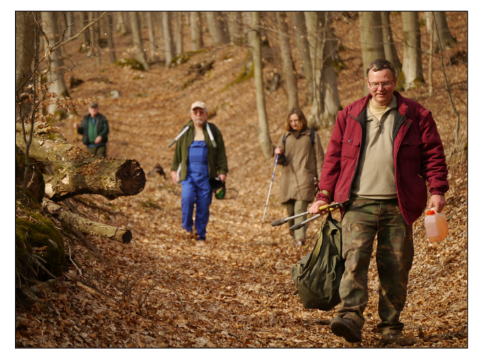
Fig. 5. At the end of a hard day

that in the early years all their efforts were focused on cleaning the ruins from the trees, bushes and surface vegetation and the first excavations could take place only three years after the Association was created ( Fig. 5 ).