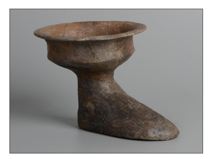
Fig. 4. Boot-shaped vessel from a Late Bronze Age grave (225 Királyok road)