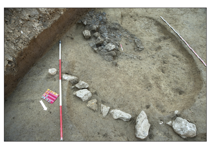
Fig. 7. Celtic semisubterranean dwelling with vessel fragments on the floor (Csúcshegy-Harsánylejtő/Csengőbojt street, photo: Nóra Szilágyi)

of (partially still existing) permanent and seasonal springs and artificial wells in the Csúcs Hill's footzone. The Department of Prehistory and Migration Period of the Budapest History Museum carried out development-led excavations during the summer and fall of 2017 in the northeastern part of the site, in an area lying 350–500 m from the stream bed, and during September 2018 slightly to the east of that<sup>4</sup>