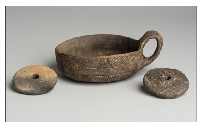
Fig. 2. Middle Copper Age spindle whorls and a cup with furrow-stitch decoration (12 Pusztakúti road)