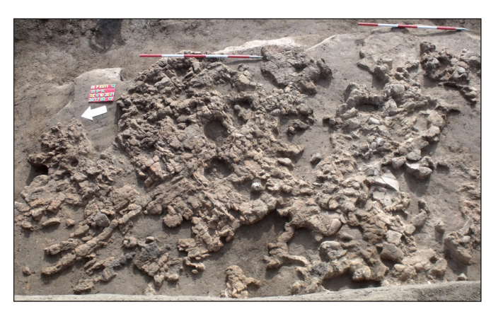
Fig. 3. Detail of a Middle Copper Age building's debris (12 Pusztakúti road,)

Age, Early and Late Iron Age, Roman Period, Árpád Period and Medieval settlements came to light during previous investigations on the territory of the factory and its wider surroundings.