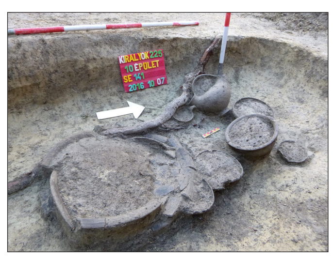
Fig. 5. Late Bronze Age scattered cremation burial with vessels positioned in a circle (225 Királyok road)

goods (deep bowls, two-handled urns, jugs, bowls, cups, a boot-shaped vessel [fig. 4], a bronze-riveted urn, a double-mouth askos, etc.) were placed in a row or circle (fig. 5), while in the graves with only two or three vessels the smaller ones were leaned up against the side of the larger one. A large, but clearly independent (Kalicz-Schreiber et al. 2010) cemetery of the Urnfield Period was almost completely excavated by László Nagy and Rózsa Schreiber between 1960 and 1983 in the vicinity: it is located only 160 m away to the southwest. The precise relation of the two necropoli is yet unclear: there is no significant difference in the character of their archaeological record regarding find material, burial customs, or chronology, and they can only be interpreted as two separate sites from a spatial point of view.