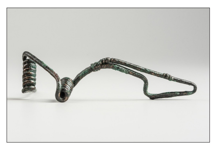
Fig. 6. Celtic bronze fibula from a layer of debris at the bottom of a storage pit (Csúcshegy-Harsánylejtő)