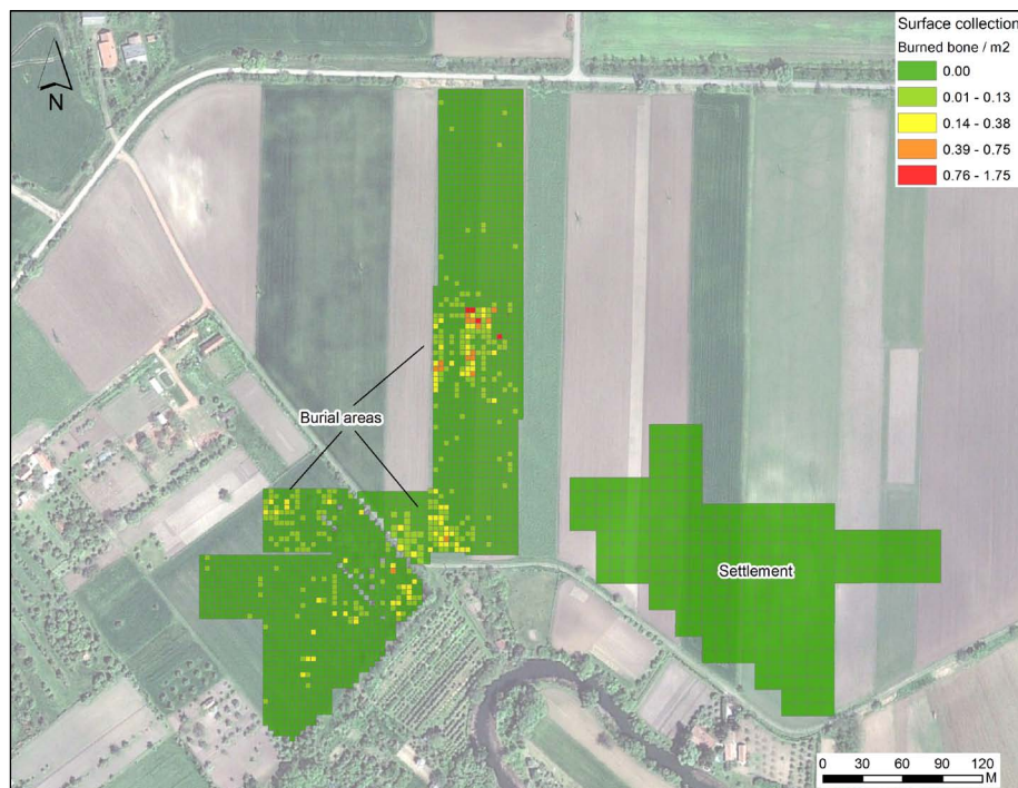
Fig. 2: The extent of burned human bone on the surface of the site

provide evidence for enriched soil, which often corresponds to ancient human activity. 7 At Békés 103, cores with enriched phosphate values correspond well to different parts of the site with abundant surface material. The distribution of surface collected ceramics and burned bone suggests discrete clusters of burials, perhaps indicating meaningful social segregation. The clusters seem to be about 100-150 meters across, not unlike at the well-known cemetery of Dunaújváros-Duna-Dűlő, a Vátya culture site on the Danube. 8