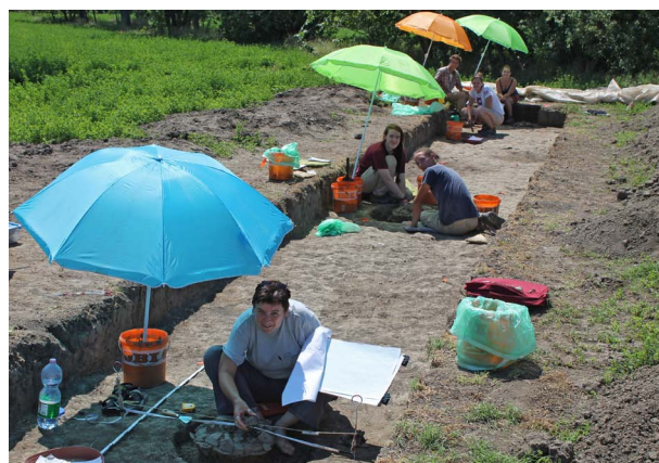
Fig. 3: Documenting cremation urn burials with a mostly Hungarian-Canadian-American crew

Almost 90 percent of burials were cremations in ceramic urns. A small minority were cremations scattered in the grave, and an equally small minority were inhumations. By binding them up in the field and transporting them to the lab, we try to recover whole cremation urns for micro-excavation. We also experiment with computed tomographic imaging (CT scans) of urns to help identify bone fragments and delicate artefacts before sediment is removed from the urns (Fig. 4). Our layer-by-layer excavations are already showing us patterns in the skeletal placement within the urns. 9 The human remains are presently being analyzed to describe the sex, age structure, health and nutrition of the cemetery population.