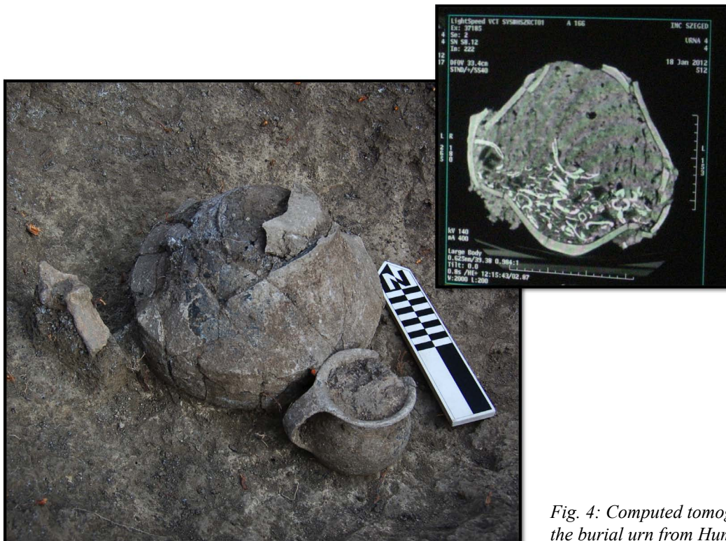
Fig. 4: Computed tomography (CT) of the burial urn from Human Burial 6