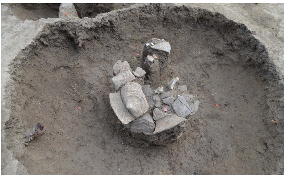
Fig. 5: The “Swedish Helmet” bowl covering a disturbed urn burial

The extent to which the cemetery members travelled and participated in the trade networks of the time is another important focus of our research. The ceramics buried with the dead are often forms known from other parts of the Great Hungarian Plain, such as the “Swedish Helmet” bowl, and many forms and decorations at the cemetery also occur in the Maros area to the south (Fig. 5).