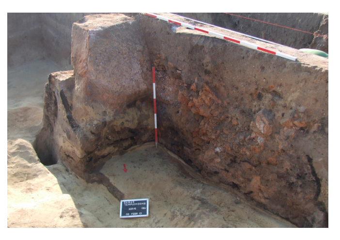
Fig. 5: Detail of house No. 223 with the rammed clay dividing wall, the debris from the tile stove and the carbonized wood paneling of the side wall

In the area we excavated we have been able to differentiate two groups of buildings, one in the southwestern section and one in the northeastern section. The road that runs between them led to the medieval church (Fig. 2). The group of buildings in the northeast is comprised of sunken, single-room, post-framed structures with round ovens (Fig. 3) surrounding a house that was twice their size, with a cellar and presumably two rooms, and heated by a tile stove (feature 223, Fig. 4). The additional buildings were organized around the largest, most prestigious dwelling. Considering the amount and quality of material finds, the difference between the central house and those surrounding it is quite prominent. In comparison with the few dozen fragments of pots, bottles and sometimes cups or mugs in the simpler structures, ten to twenty times the finds were found in building 223, and in addition to the aforementioned types of vessels the set of household ceramic utensils included various jugs, strainers, pans, large storage vessels and lids, as well as an imported Austrian pot with a trademark. We are not able to work out the structure of the central building precisely because we were only able to document its cellar, the ruins of its dividing