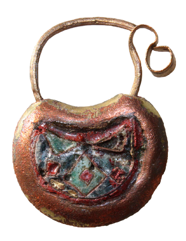
Fig. 6: A genuinely special find is the gilded, cloisonné copper earring fitted with a loop ending in an S-curve.

wall and the side wall that was clad in pine boards ( Fig. 5 ). Its owner may have been a well-off noble. The clear evidence of the presence of the social elite is the gold and gilded objects, such as the cloisonné earring ( Fig. 6 ) or the ducat of the Venetian doge Andrea Contarini. Most of these were discovered as stray finds from the entire excavation area during the stripping of the topsoil with an excavator.