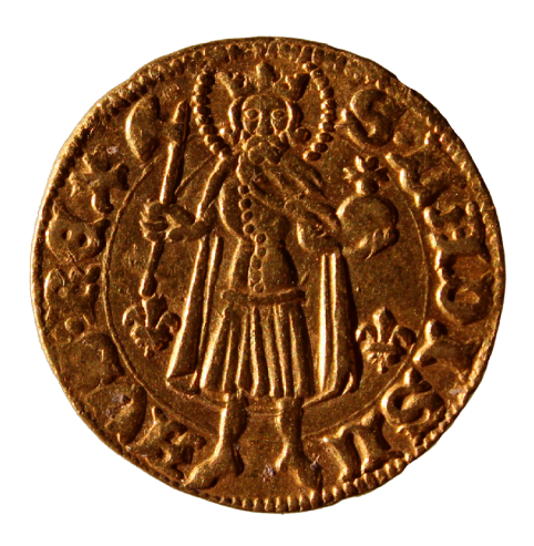
Fig. 14: In addition to the two gold forints of Sigismund of Luxemburg, during the excavation of the church and the cemetery over one hundred scattered medieval coins were found.