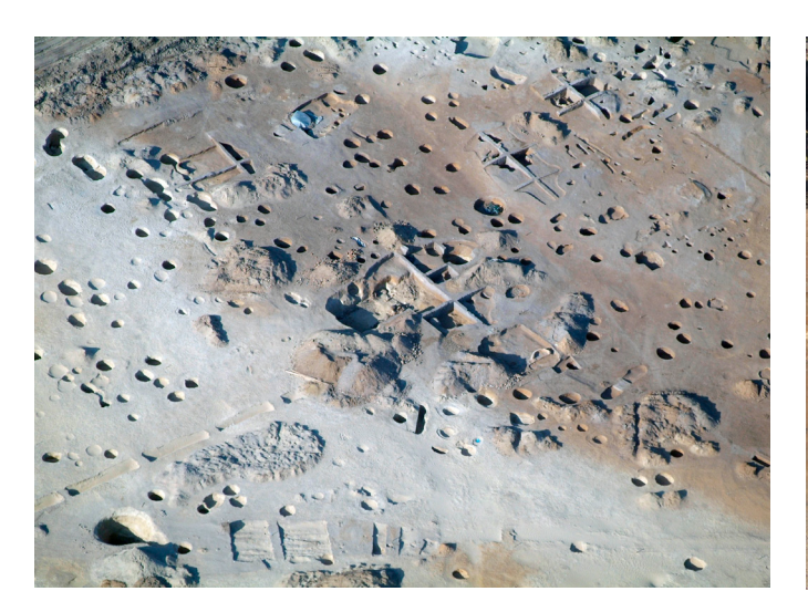
Fig. 2: The settlement structure is clearly visible in the aerial photographs: above is the row of single-room semisubterranean houses, in the middle is house No. 223, and below is the section of the road leading to the church that was uncovered.