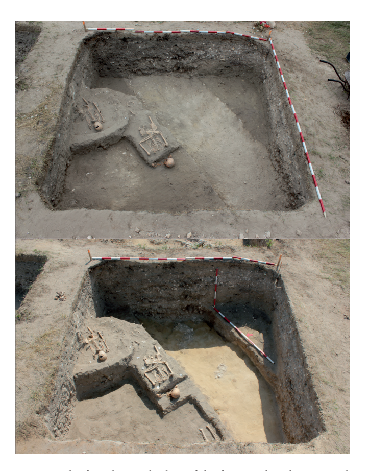
Fig. 7: The foundation ditches of the former church appeared as ditch-like trenches loosely filled with broken stone and sandy mortar.

In 2012, with understandable curiosity, we began investigations into the church ruins as well as into the cemetery around the church. The opportunity for this was provided by the construction of a memorial displaying the remains and the ground plan of the church. Written sources inform us that the stones