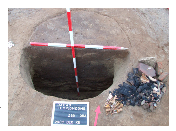
Fig. 1: The beehive-shaped pits used for crop storage before the fire were filled with sooty, ashy debris, daub and trash that preserve the memory of the devastation.

Almost without exception Hungarian medieval village excavations have documented the traces of settlements abandoned by their inhabitants, vacated houses and ditches. Groups of finds that represent outstanding value or complex architectural solutions that stand out from the ordinary are rarely uncovered. Following the 14th century fire in Dabas, the ruins were partially cleared away, which is evidenced by numerous pits containing ashy fill, clay debris and burned fragments of pottery ( Fig. 1 ). At the same time, several houses have preserved the household items for everyday use of the former inhabitants, such as agricultural tools, horse gear and lock mechanisms, and these are of great interest to us. The buildings that they inhabited or used at this time can be clearly differentiated on the basis of the evidence