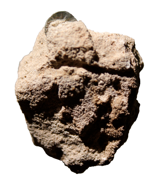
Fig. 8: The Sigismund-era coin found by metal detector in a fragment of plastering together with the parvus coin discovered in the foundation precisely dated the late medieval church.