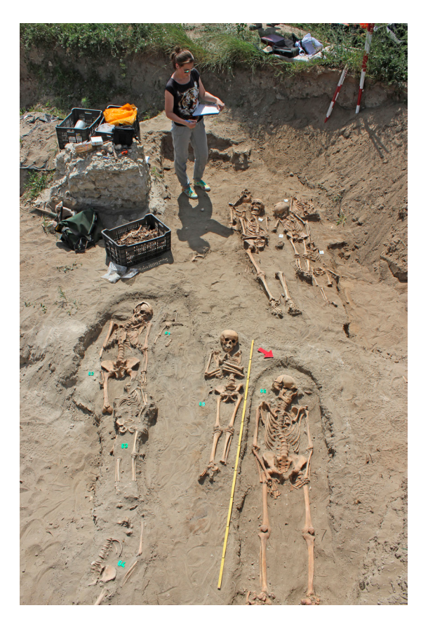
Fig. 9: Detail of the churchyard cemetery with the remains of a wall from the Árpád Dynasty church in the background