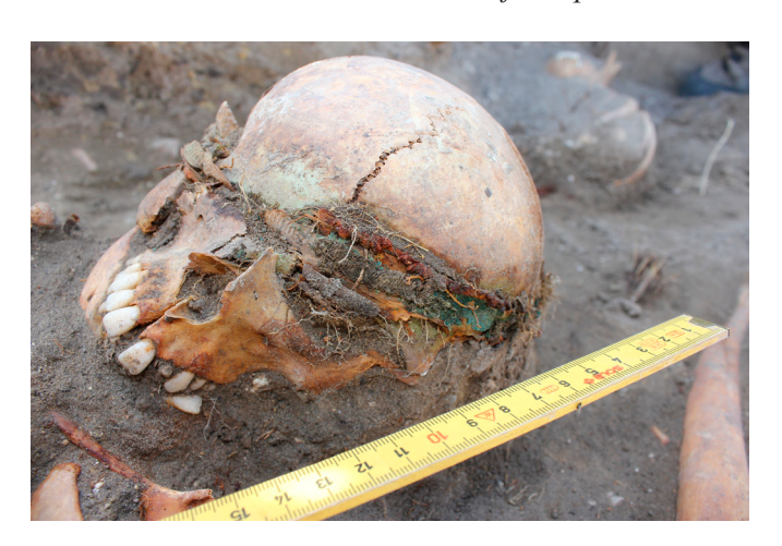
Fig. 11: Headdress in grave No. 67