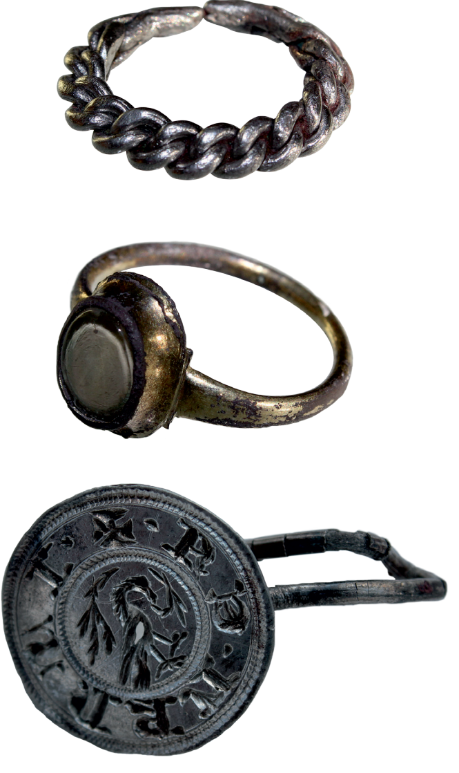
Fig. 13: Rings were the most common find in the churchyard cemetery.