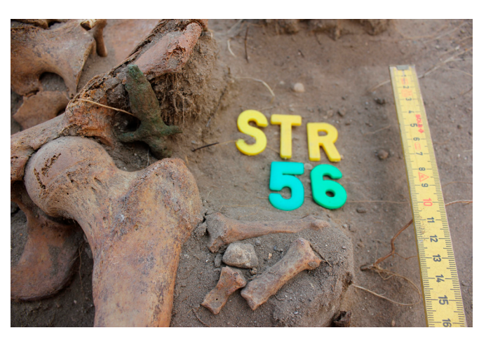
Fig. 12: The bronze crucifix may have been placed in the hand of the deceased for burial.