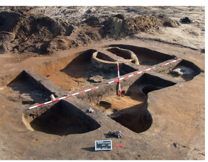
Fig. 3: In the single-room house No. 270 we found a round oven, a rammed clay floor, remains of broken beams and several intact pots.