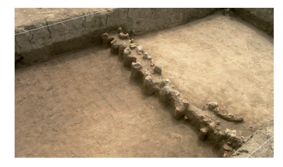
Fig. 5: Burnt remains from the rammed clay rampart

The fortifications extended to ca. 400 hectares, thus we identified the largest prehistoric fortification presently known in Hungary (Fig. 9). However, this site, unparalleled in Hungary, can be connected with a system of fortified settlements spread over a large area, since fortification systems of similar size were erected across the border in Serbia and Romania as well. The existence of several fortified settlements in the area of the Békés-Csanád loess plateau and Temesköz regions can be demonstrated during the Late Bronze Age. These earthworks were varied in both their sizes and the number of fortifications. More than twenty fortified settlements of this type can be found in Békés, Csongrád, Arad and Timiş counties. The field research on these in Hungary has been limited up to this point to just a few sites, such as Orosháza-Nagytatársánc<sup>6</sup> and