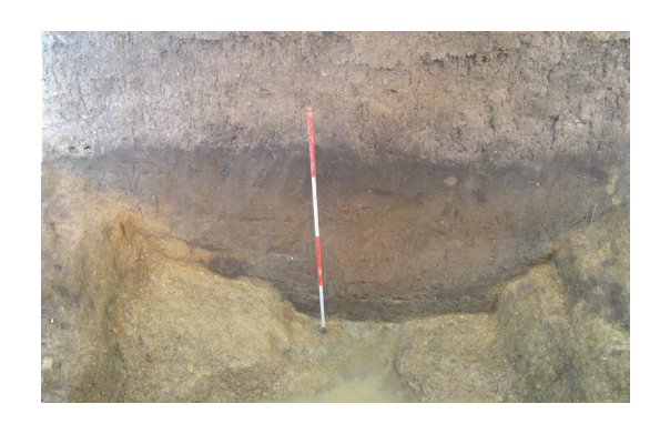
Fig. 7: Ditch No. 201