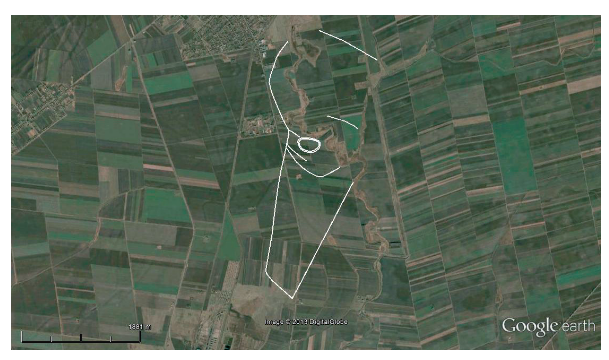
Fig. 9: The system of fortifications at Csanádlapota-Földvár on the Google Earth image