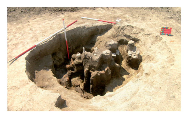
Fig. 2: Pit 44/51 and its complex fill with burnt strata and finds