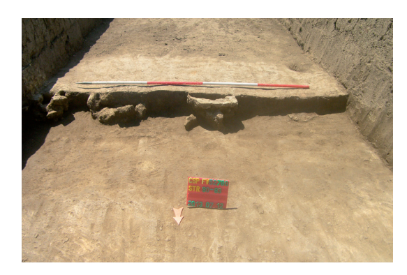
Fig. 6: The clay-lined postholes of the palisade wall