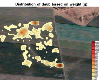
Fig. 4: Results of the systematic field walks

results. The cores showed the rampart as well as two ditches that were about 3 m deep, which was supported by the images from the magnetometer.