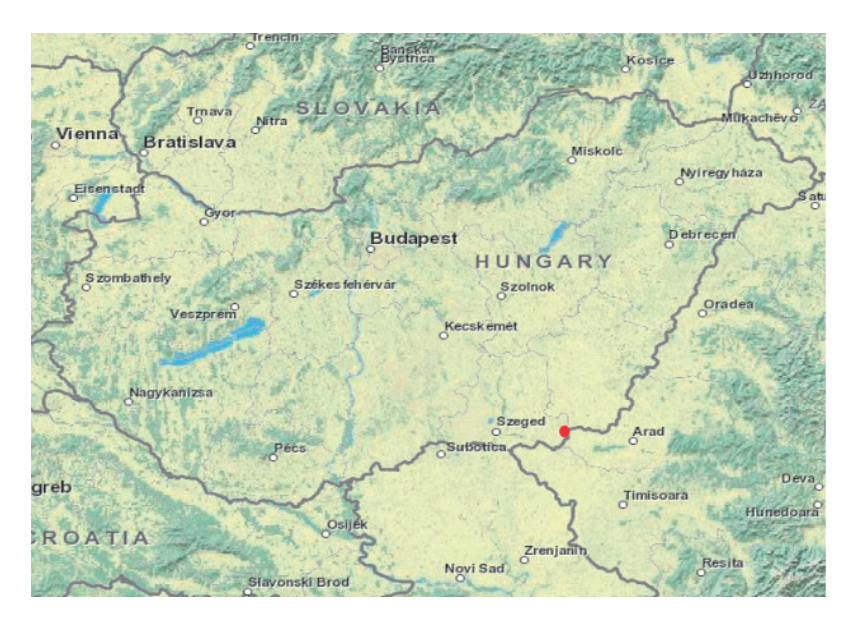
Fig. 1: Csanádpalota

During the course of the excavation of the M43 motorway's right-of-way, we combined the methods characteristic of large-scale digs with more delicate excavation techniques, the recording of strata and and