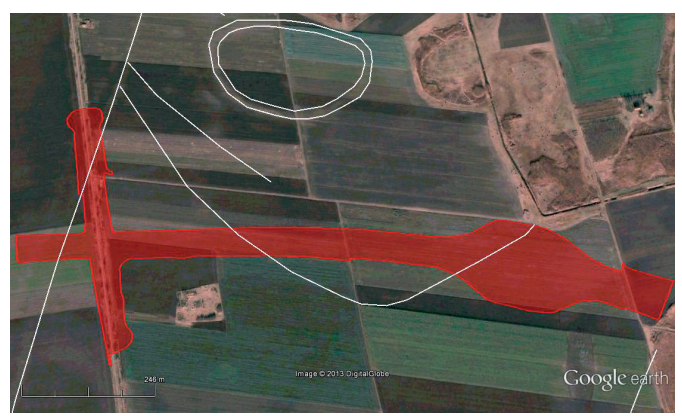
Fig. 3: The concentric ditches of the earthworks' central section and the excavated area (red) along the motorway's right-of-way

systematic sampling generally used in planned excavations, so we obtained more detailed information in relation to the archeological site. We were able to isolate several features that can be placed in the middle period of the Late Bronze Age (Pre-Gáva period, 1300–1100 B.C.). However, evidence suggesting buildings – debris, remains of wooden structures, postholes and floors – was unfortunately not discovered. On the other hand, the pits of various sizes that were rich in finds served as proof of Late Bronze Age settlement. In the fill of the majority of these we came across traces of complex, presumably ritual acts ( Fig. 2 ).