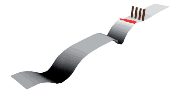
Fig. 8: Relief map of the ditches and the rampart, as well as the 3D reconstruction of the palisade wall